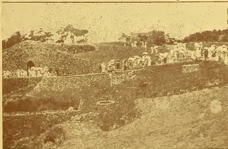
GOING HOME FROM CHURCH, KULIANG, FOOCHOW

Congregational Woman's Boards of Missions PUBLISHED IN BOSTON